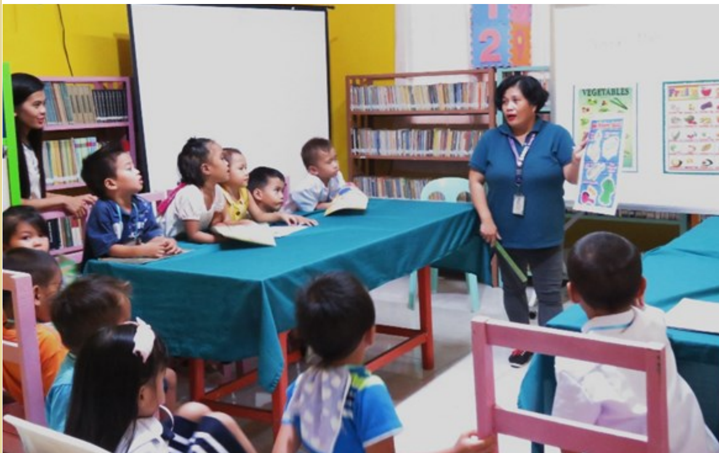
The Pupils of Day Care Center of Brgy. Washington during their learning visit in SCLA

During summer, children participated in various activities like origami making, story telling, flash card, games, chess, etc.