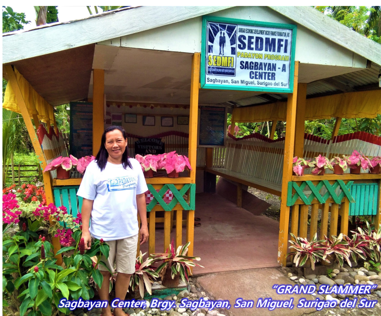
"GRAND SLAMMER" Sagbayan Center, Brgy. Sagbayan, San Miguel, Surigao del Sur