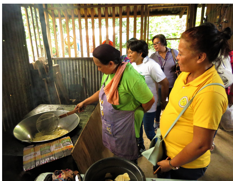
Client-Exposurists with the members of Rural Improvement Club's Banana Chips Production in Placer, Surigao del Norte on October 30, 2018

The participating clients were introduced to some of our successful entrepreneur-clients and given opportunity to witness the actual operations of their business and learn how they manage their respective micro-enterprises.