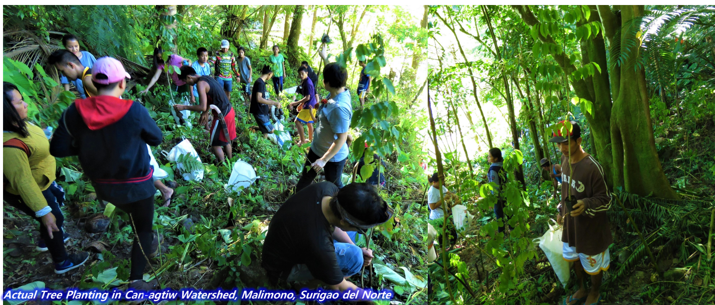
Actual Tree Planting in Can-agtiw Watershed, Malimono, Surigao del Norte

In 10 months of implementation, a total of five (5) hectares were planted with 2,000 Endemic Trees. A total of 200 individuals composed of SEDMFI Staff, Malimono LGU, High school students, Religious groups and local residents had participated.