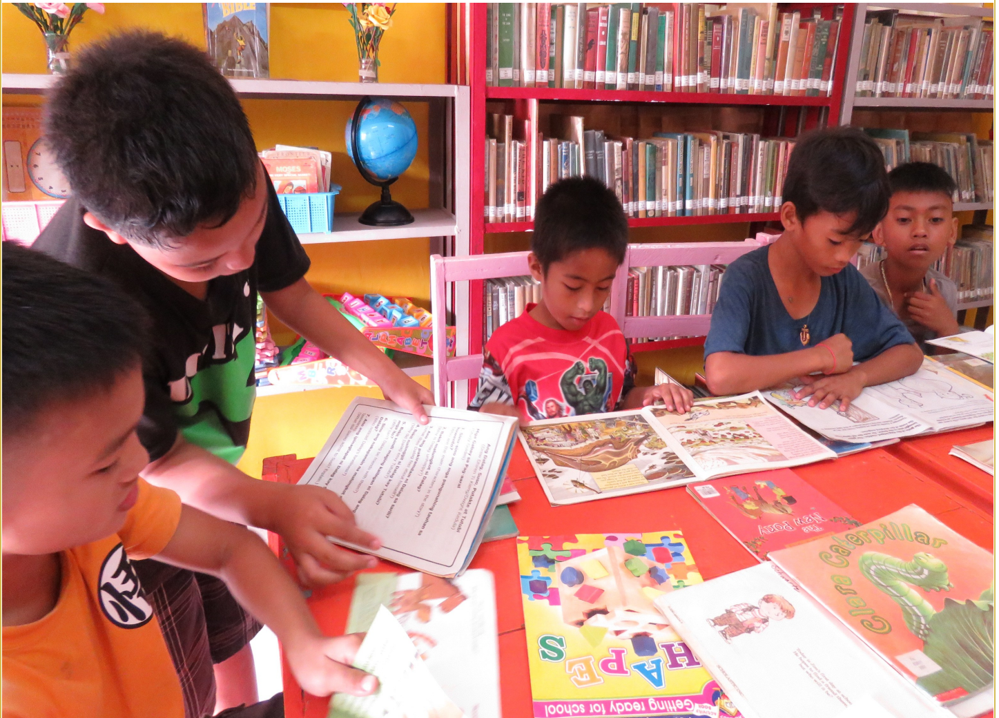
Children's Regular Visit in the Library

SCLA cultivates the spirit of fun in learning, making children become more interested to visit the library as a conducive place for discovering knowledge, interests, talents, creativity and developing clean social relationships.