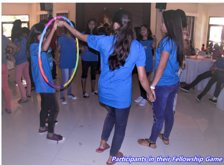
Participants in their Fellowship Game

At the end of the fellowship, the participants were thankful for the opportunity of coming together and having fun with their fellow beneficiaries and parents/guardians. They were also grateful for the knowledge they learned from the inputs and testimonies. HI-SEA and CEA Beneficiaries Fellowship is conducted annually since 2016.