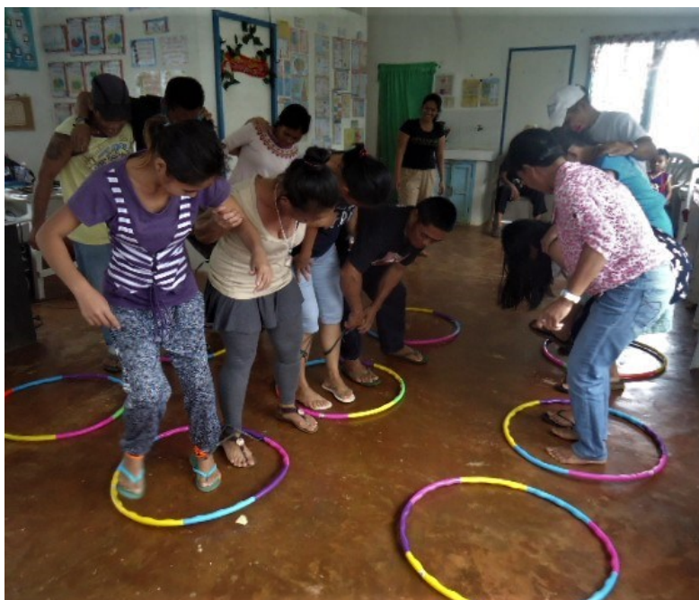
People's Organization (Farmers' Group-Villariza) of Malimono, Surigao del Norte in their Team Building Activity

This year 1,565 Clients/PO's participated in the above orientations/seminar-workshops. Participants have gained important learnings in the management of their center/organization, and finances.