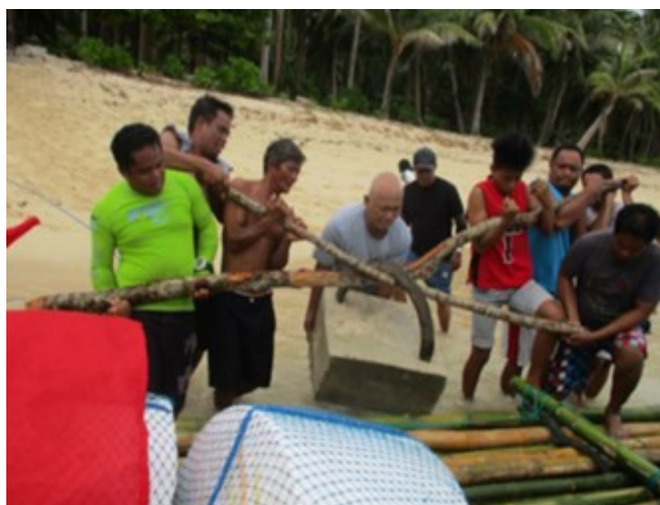
MPA Establishment with Partner POs in Alegria, Sta. Monica, Siargao on October 14, 2018

Duration of the project is one (1) year only but because of significant results and impact to the communities, the project was extended for another Five (5) months.