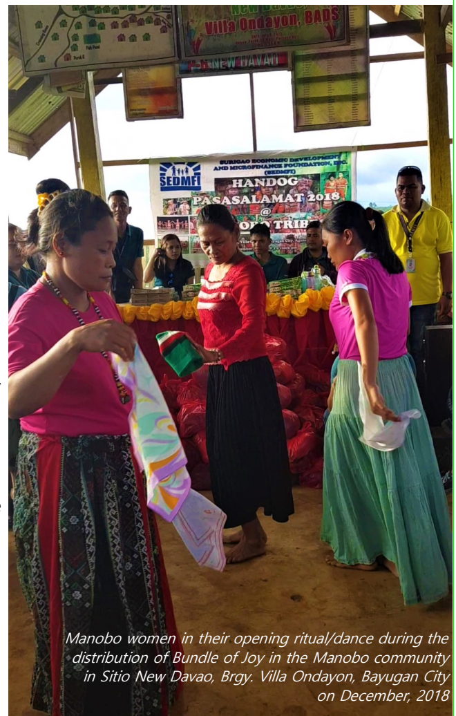
Manobo women in their opening ritual/dance during the distribution of Bundle of Joy in the Manobo community in Sitio New Davao, Brgy. Villa Ondayon, Bayugan City on December, 2018