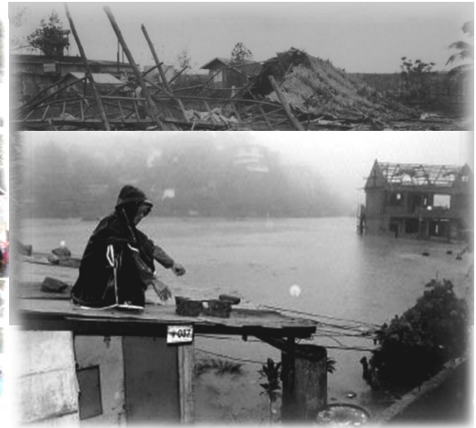
Surigao del Norte devastated by Typhoon Nitang in September 11, 1984

The Surigao Economic Development and Microfinance Foundation, Inc. (SEDMFI), formerly Suirgao Economic Development Foundation, Inc. (SEDFI), is a private, non-profit, non-stock and non-political service organization established on January 12, 1985 and registered with the Securities and Exchange Commission (SEC) on June 7, 1985. SEDFI is a duly registered done institution under provisions of BIR-NEDA Regulation No. 1-81.