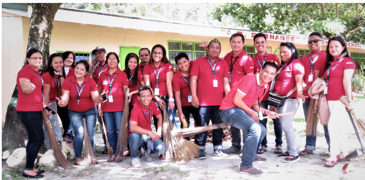
HO-MF Staff Participation in Brigada Eskwela at Togbongon Elementary School, Brgy. Togbongon, Surigao City on June, 2018

For five (5) years of active participation in the Brigada Eskwela of DepEd, our foundation has gained recognition as one of the primary contributors in the success of the said school maintenance activity.