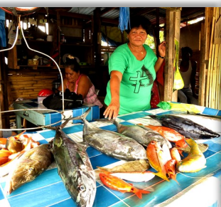
One of our Clients in Micro-entrepreneurs Development Program (MEDP)