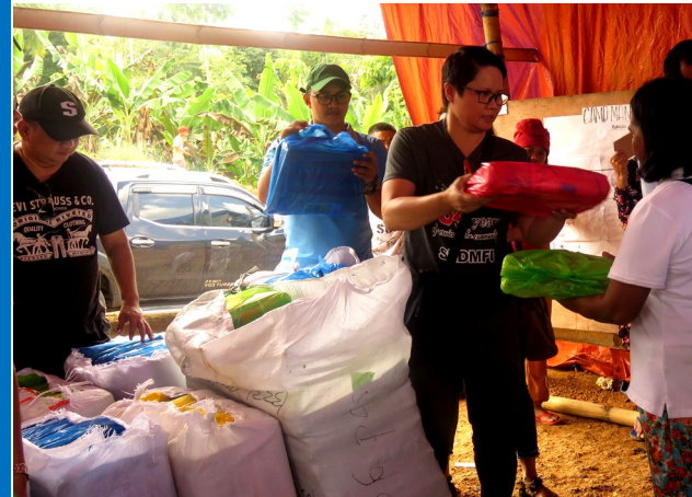
SEDMFI, in partnership with the Kasilak Foundation, gives relief goods to earthquake affected families in Cotabato