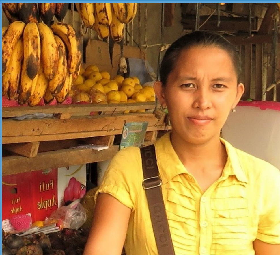
Long-time Client of Micro-entrepreneurs Development Program (MEDP) of the foundation

Adopt A Watershed Project: Tree Planting Activity at Can-agtiw Watershed, Malimono, Surigao del Norte