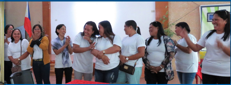
SEDMFI Center Chief Fellowship