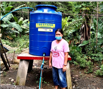
One of our Clients in MEDP WASH (Water, Sanitation and Hygiene) Loan Product