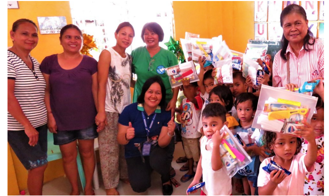
Giving of Hygiene Kits to the pupils of Poctoy Day Care Center, Brgy. Poctoy, Surigao City

I ntegrity S olidarity P ro-environment I nnovativeness R esponsiveness E xcellent