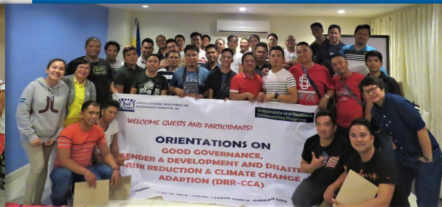
SEDMFI Staff Capacity Building Activity