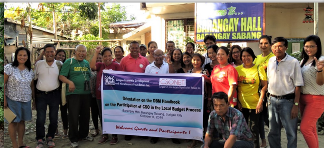
Our Partnership activity with the Surigao City CSO Network in the advocacy for the participation of the CSOs in the Local Budget Process.